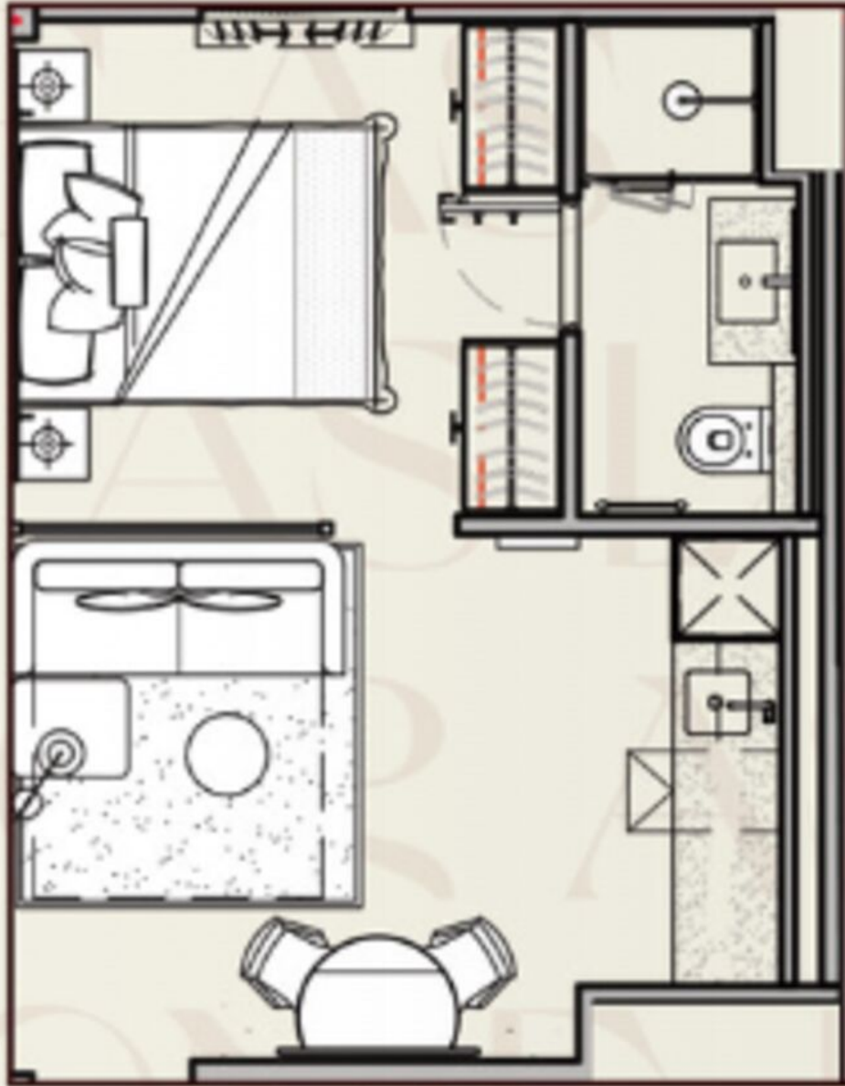
Club Classic Flat