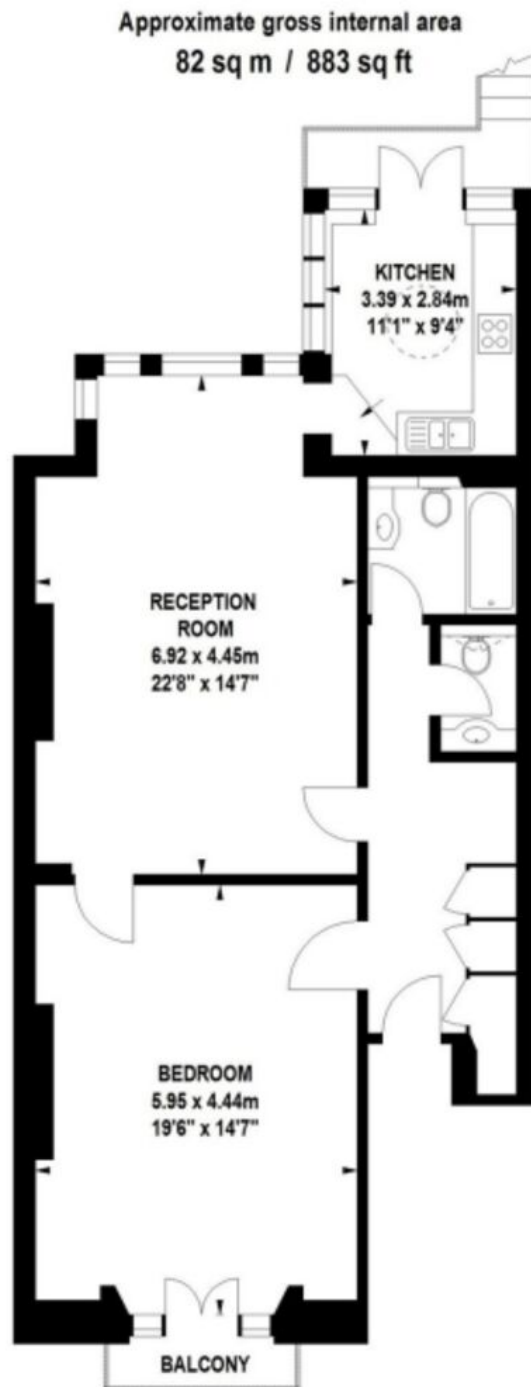
Raised Ground Floor